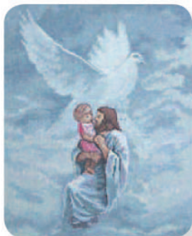
This project, stitched on 18ct with 32 shades of blue, was the cross stitch design that inspired the conception of Easy-Count Guideline!

This product is an asset to any stitcher and is easy to add, no matter how large or how small the cross stitch project or kit might be. Be the first in your cross stitching group to enhance